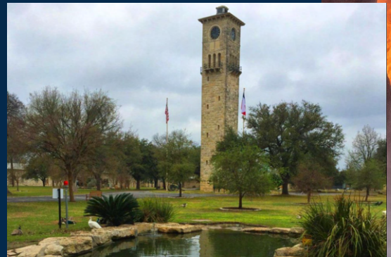
JBSA - FORT SAM HOUSTON