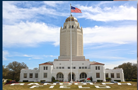
JBSA - RANDOLPH