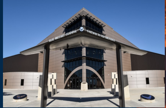
JBSA - LACKLAND